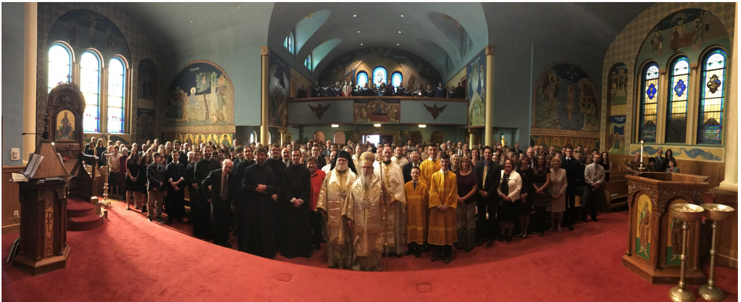
Panorama of those present at the Divine Liturgy on the weekend of the Centennial Celebration for Annunciation GOC in Akron.